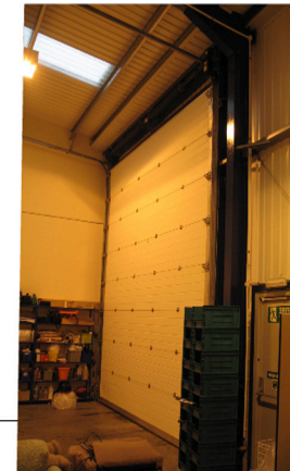
Some good photos of the site - front on - not like this unless is views obstructions