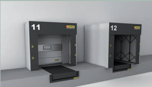
KDTR dock tunnel KDTR dock tunnel