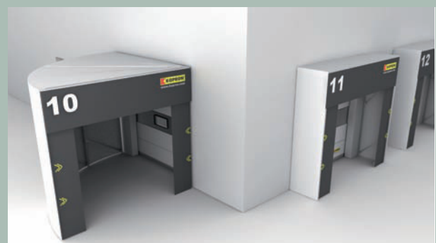
KDT / KTC a terra standard/a chiocciola KDT/KTC ground/rotative Dock Shelters