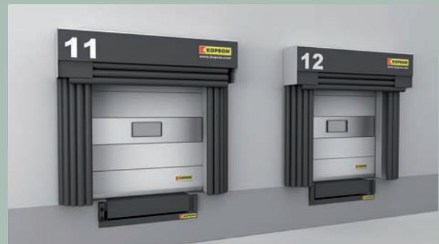
KDRG gonfiabile KDRG inflatable