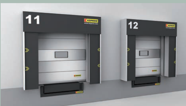
KDRF a fianchi flessibili KDRF Flexible Sides Dock Shelter