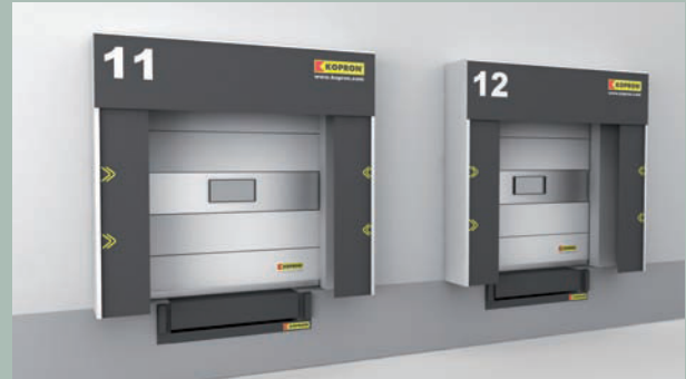
KDR a ribalta standard KDR Standard raised dock shelters

The several models Kopron propose (ground or raised dock shelters, inflatable or rotative ones, with either fixed or adjustable cushions) allow to chose the best solution.