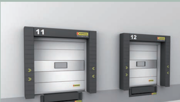
KDRC a cuscini fissi o regolabili KDRC with fixed or adjustable cushions